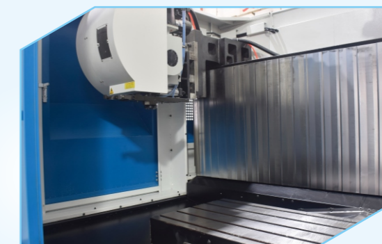
24T magazine tool