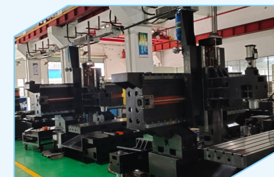
Gantry type design